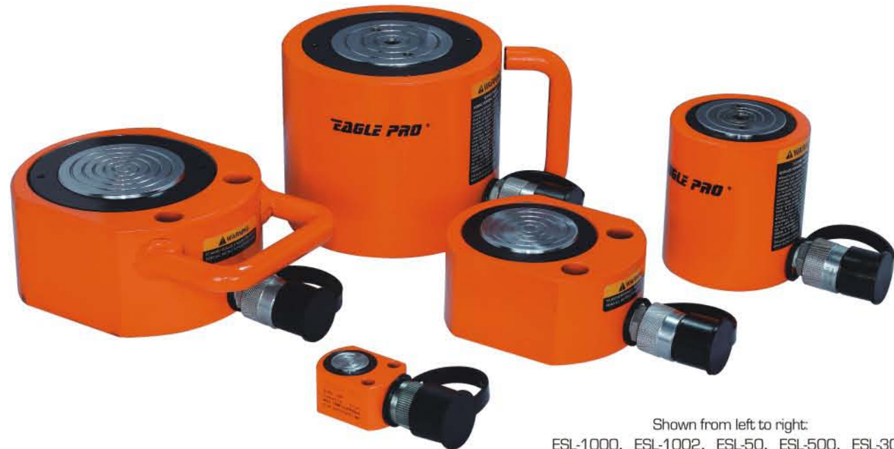
Shown from left to right: ESL-1000, ESL-1002, ESL-50, ESL-500, ESL-302