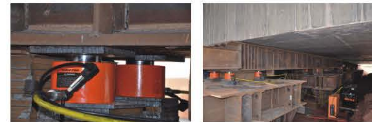
24 EAGLE PRO ESL series hydraulic cylinders with an EAGLE PRO electric hydraulic pump lift a bridge into position